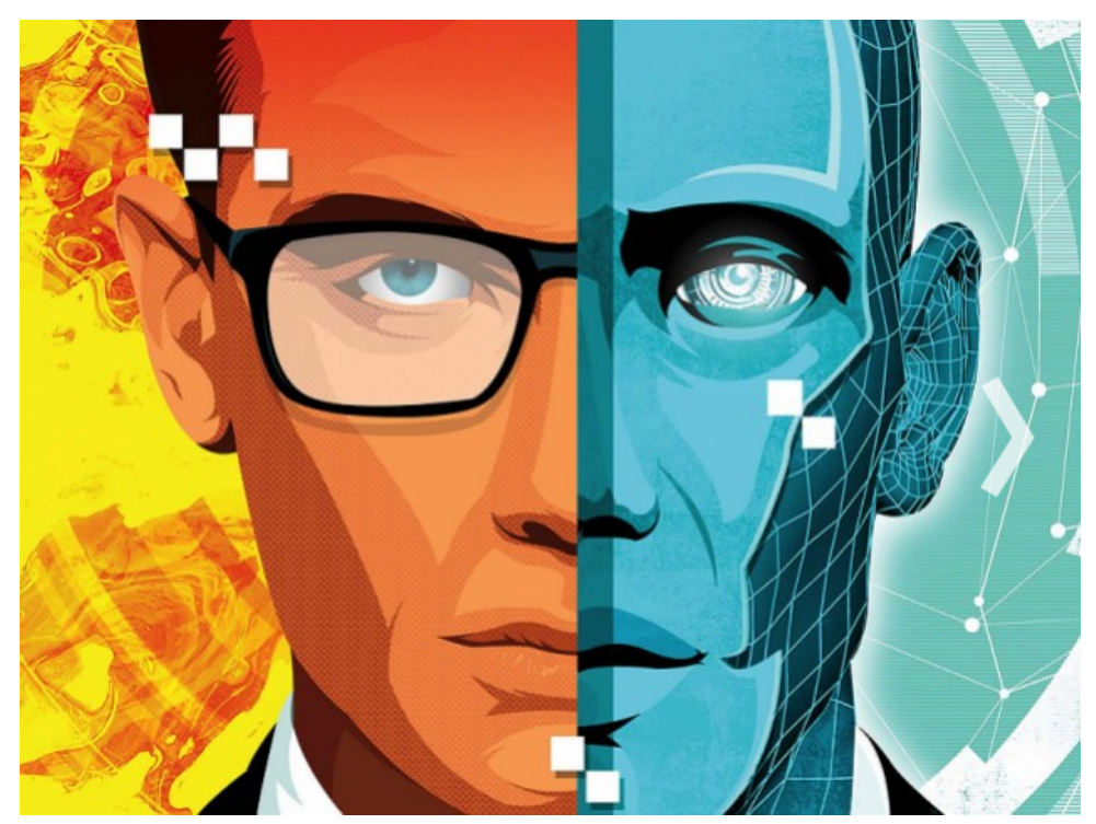
Illustration by Taylor Callery