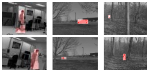
Fig. 1. Detection of moving people (top and bottom) and a moving vehicle (middle) from a hand-carried camera. Each row illustrates two (non-consecutive) frames of long image sequences taken from several seconds apart.

The ability to verify the epipolar constraint for arbitrary flow fields using only low-dimensional projections of the original flow field provides a simple basis for detecting independently moving objects. For this purpose we need to incorporate only one or a small collection of directional components of the flow field. The image locations where the linearity and the divergence constraints of projections are violated are considered as regions with independent motion.