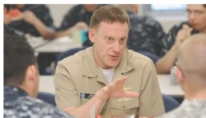
Navy Cyber Commander Tapped to Head NSA In "Military Personnel"