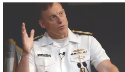
NSA Director Rogers Talks About the Future of Encryption In "Budget Industry"