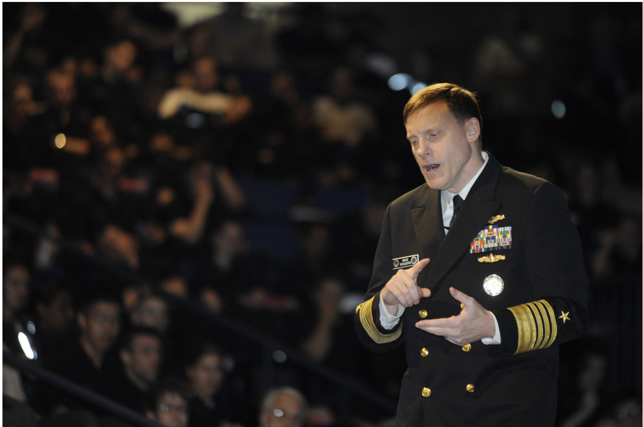
Adm. Michael S. Rogers, commander, U.S. Cyber Command (USCYBERCOM) and head of the National Security Agency.

February 23, 2017 3:07 PM • Updated: February 23, 2017 11:54 PM