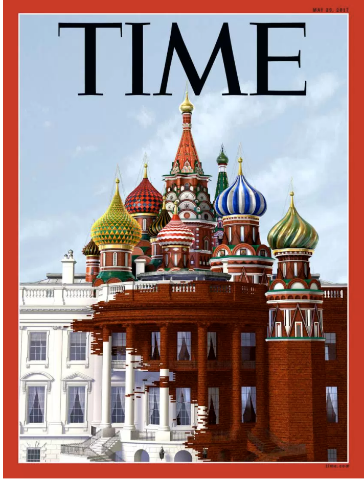
Illustration by Brobel Design for TIME