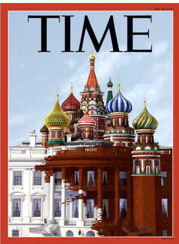
Illustration by Brobel Design for TIME

As they scrambled to contain the damage from the hack and regain control of any compromised devices, the spy hunters realized they faced a new kind of threat. In 2016, Russia had used thousands of covert human agents and robot computer programs to spread disinformation referencing the stolen campaign emails of Hillary Clinton, amplifying their effect. Now counterintelligence officials wondered: What chaos could Moscow unleash with thousands of Twitter handles that spoke in real time with the authority of the armed forces of the United States? At any given moment, perhaps during a natural disaster or a terrorist attack, Pentagon Twitter accounts might send out false information. As each tweet corroborated another, and covert Russian agents amplified the messages even further afield, the result could be panic and confusion.