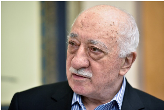
U.S.-based Turkish imam Fethullah Gulen was the subject of the Flynn Intel Group's unfinished documentary.

Export-Import Bank, got in touch to express sympathies with Ms. Bakhtiar in 2005, after her father died. Ms. Bakhtiar's uncle, who served as the last prime minister of Iran before the 1979 revolution, was assassinated in Paris in 1991.