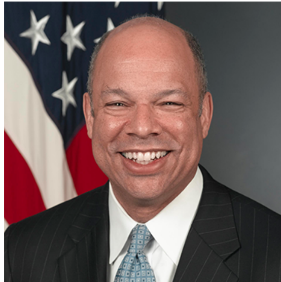
Former DHS chief Jeh Johnson said he worried about a catastrophic attack against U.S. voting systems in the 2016 elections.

"Last year, when we saw these voter registration databases being targeted, I was very worried it was the run-up to a huge catastrophic attack," that would result in the deletion of voter