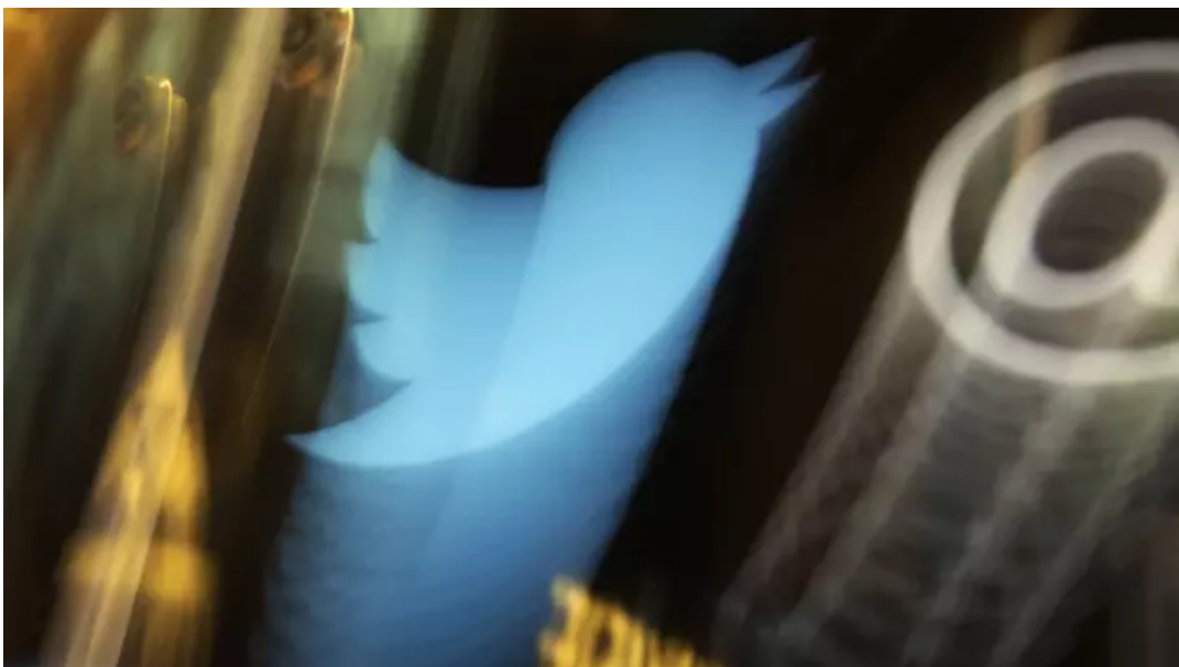
Twitter storm: the platform was criticised for its evidence at a recent Senate intelligence committee hearing

"The typical librarian in an elementary school library has more training than Facebook managers who are the decision makers," he says. "The starting point in Silicon Valley is to favour methods that are highly scalable, with no person involved, and to assume that only engineering has an answer. We are seeing, to put it generously, the limitations of that line of reasoning."