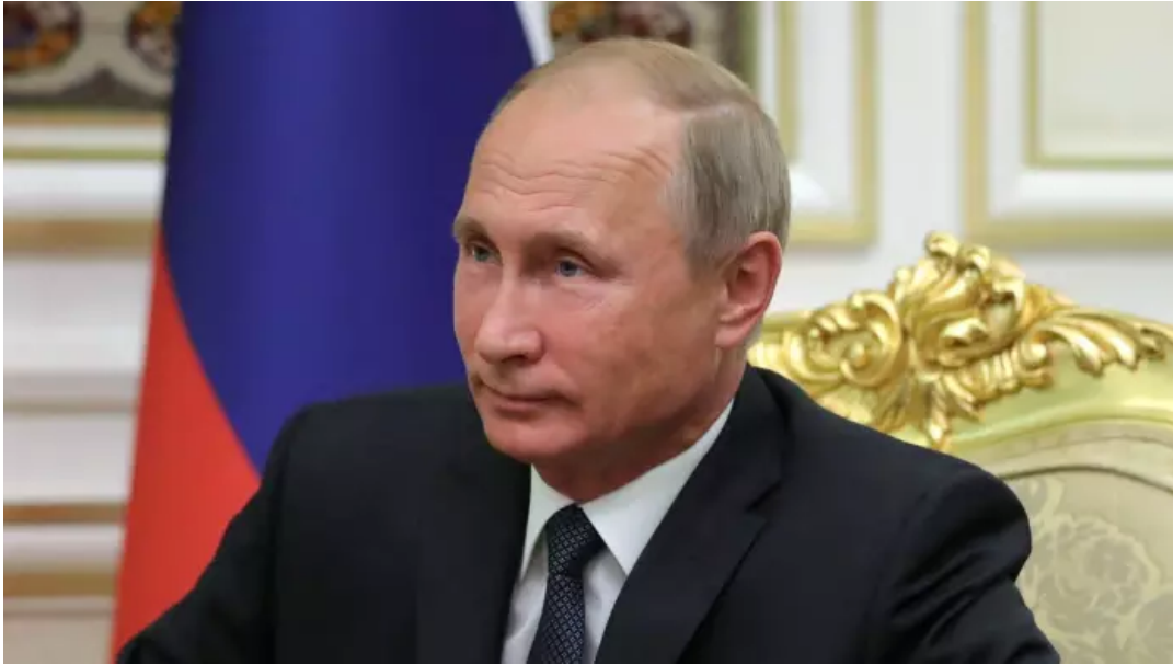
Russia's president Vladimir Putin

it has yet to persuade politicians that its efforts will be enough — or that Russia’s meddling does not stem from a deeper structural problem with its business.