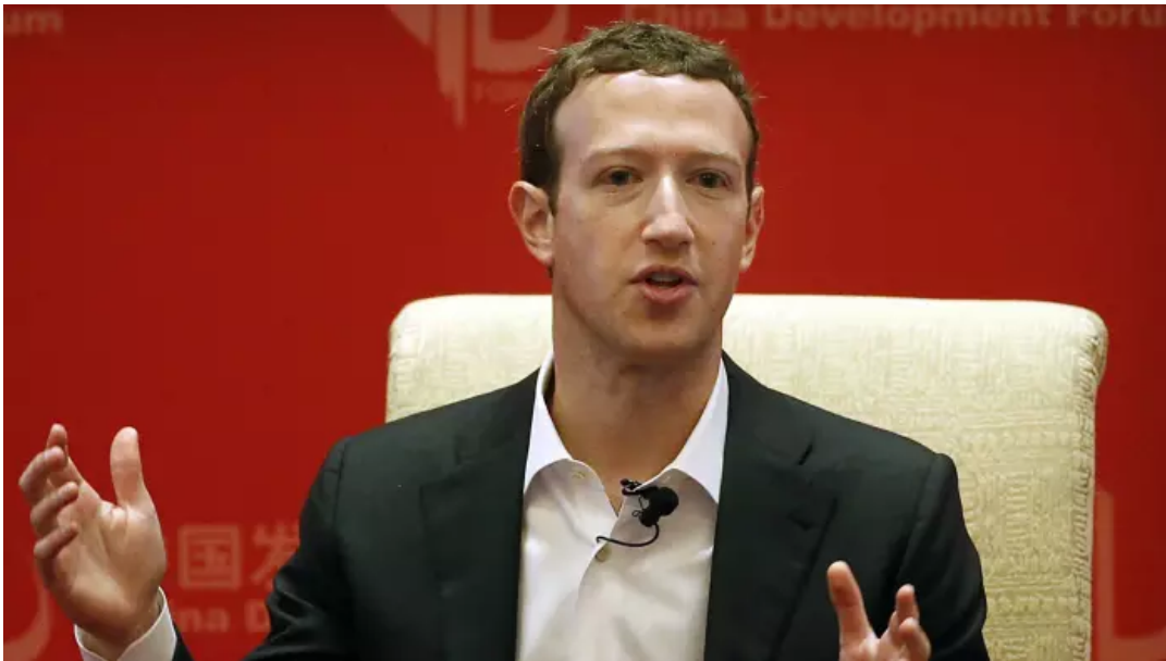
Facebook CEO Mark Zuckerberg is likely to face further calls to tighten control of ads on the site

“In the next 12 months we’re going to see the mother of all fines levied at one of these companies,” he says, adding that it might be from Europe, rather than the US. Amazon and Apple were hit with tax demands from Brussels last week . “The worm has turned and someone will get elected into office based on a populist attack on one or more of these firms.”