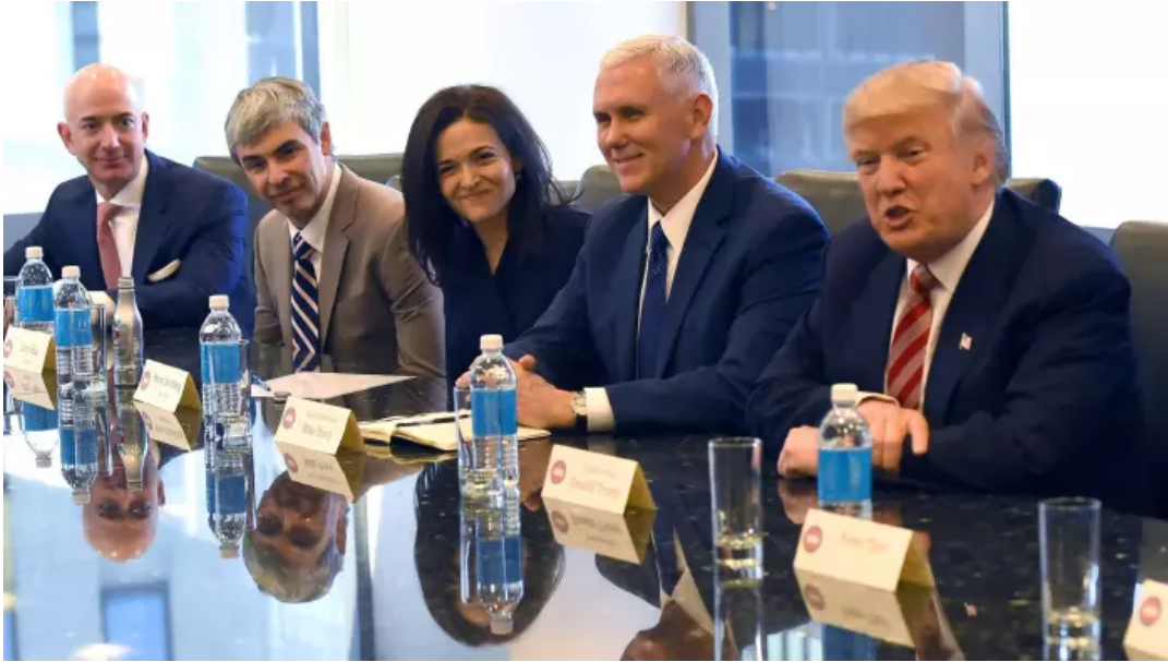
Tech forum: Amazon chief Jeff Bezos, Alphabet CEO Larry Page and Facebook chief operating officer Sheryl Sandberg with President Donald Trump and vice-president Mike Pence. They met before Trump's inauguration last December

One response of the tech industry is to rehearse a well-worn argument against heavy-handed government intervention to curtail free speech online.