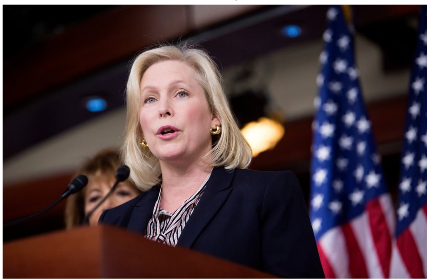
Eric Thayer for The New York Times

(https://www.nytimes.com/2017/11/17/us/politics/sexual-misconduct-capitol.html? action=click&module=MoreInSection&pgtype=Article&region=Footer&contentCollection=Politics)