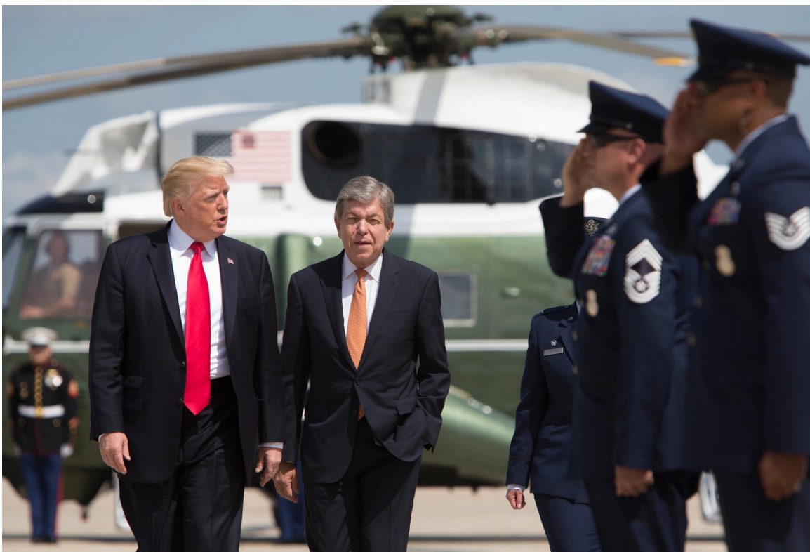
President Trump lobbied Senator Roy Blunt in August during a trip on Air Force One to “wrap up” the investigation.

Republicans played down Mr. Trump’s appeals, describing them as the actions of a political newcomer unfamiliar with what is appropriate presidential conduct.