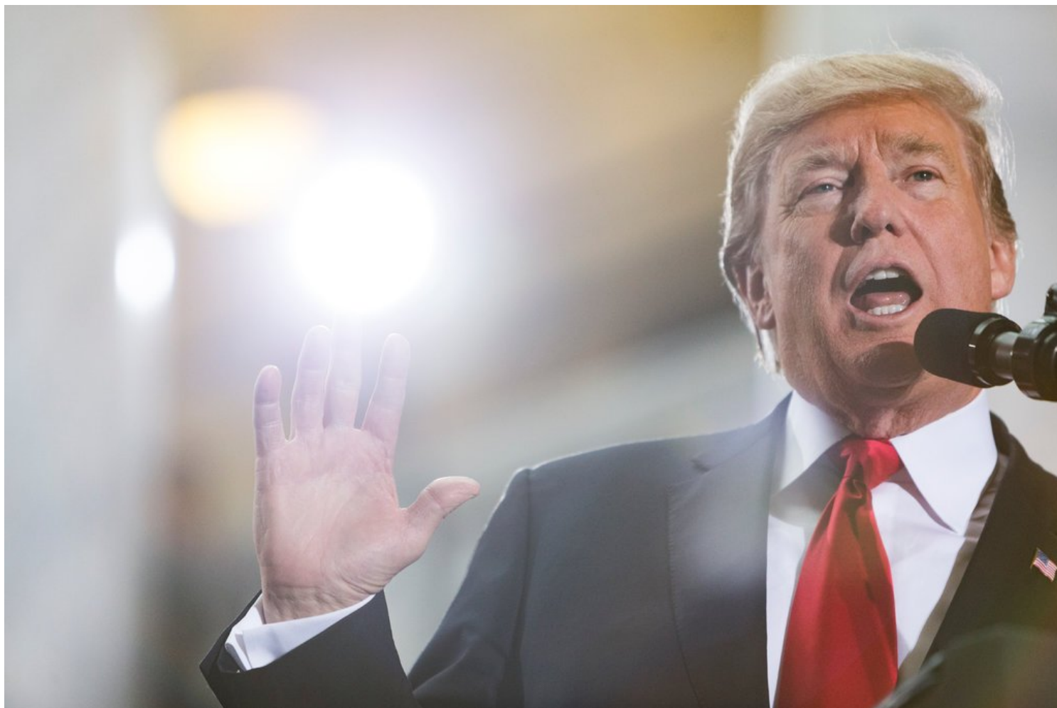
Tom Brenner/The New York Times

( https://www.nytimes.com/2017/12/05/us/politics/trump-moore-republicans-chaos.html?action=click&module=Associated&pgtype=Article&region=Footer&contentCollection=The Trump White House )