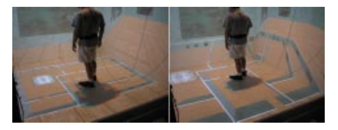
Figure 4 A user prepares to scale the Step WIM upward using the Interaction Slippers (left). As the user moves forward the Step WIM gets larger and his position in the miniature is maintained (right).

When wearing Interaction Slippers to control the Step WIM, the user activates and deactivates Step WIM scaling mode by clicking the heels together (as distinguished from clicking the toes together). This scaling mode overrides the previous Step WIM controls until it is deactivated by a second heel click. When the user first enters Step WIM scale mode by making heel cloth contacts, the user's head position is projected onto the Step WIM and stored. This projected point is used as the center of scale for changing the size of the Step WIM. As the user walks, instead of moving about within the Step WIM, the Step WIM is translated, so that the center of scale always lies at the projection of the user's head onto the floor (See Figure 4). In addition, if the user walks forward with respect to the Step WIM, as if to get a closer look, the Step WIM gets larger. If the user walks backward within the Step WIM, as if to see a larger picture, the Step WIM scales smaller. To return to the standard mode of controlling the Step WIM with toe taps, the user must again click his or her heels together. This second heel click freezes the scale of the Step WIM until the next time the user enters Step WIM scale mode.