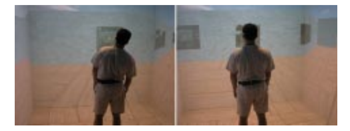
Figure 5 A user leans to the right (left) to view a painting (right).

In addition to navigating relatively small distances by leaning, the user can also lean to translate the Step WIM to gain access to Step WIM locations that would not otherwise fit within the user's physical walking area. The decision to move the Step WIM widget by leaning instead of navigating through the virtual environment depends on whether the Step WIM is active and whether the user's gaze direction is 25 degrees below the horizontal (i.e., at the Step WIM).