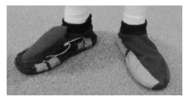
Figure 3 The Interaction Slippers allow users to tap either their toes or heels to trigger Step WIM functionality.

To invoke the display of the Step WIM with these Slippers, the user taps his or her toes together, establishing a conductive cloth contact which is easily sensed and treated as a "button" press. Once displayed, the user can move to a new location by simply walking to a desired place in the Step WIM and clicking the toes together again, while looking at the Step WIM. To dismiss the Step WIM,