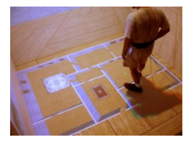
Figure 2 The Step WIM widget which allows users to quickly navigate anywhere in the virtual world. The small sphere by the user's foot indicates his position in the miniature.

A more general although less frequently explored approach is to map body gestures directly to virtual environment navigation. Fuhrmann, et al[8] developed a head-directed navigation technique in which the orientation of the users head determined the direction and speed of navigation. Their technique has the advantage of requiring no additional hardware besides a head tracker, but has