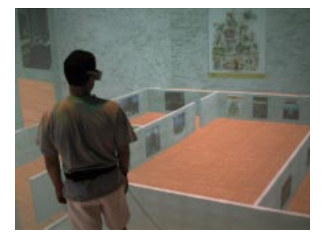
Figure 1 A user examining the Step WIM.

Each year computational power inexorably increases and virtual environments become richer as increasingly realistic displays of virtual scenes become viable. Despite this continuing progress in visual realism, the ability of a user to engage in rich interactions in a virtual environment fails to follow such a steady advance. In fact, it can be argued that the quality of user interaction moves in opposition to the complexity of virtual environments because the number