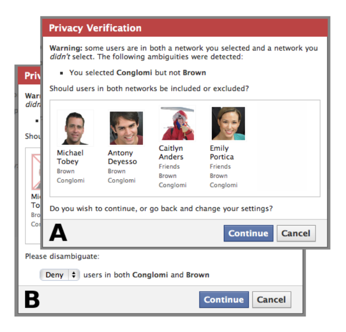
Figure 2. The privacy warnings in the two experimental conditions. In the Warn condition (A), participants were warned of an ambiguity without given any guidance. In the Choose condition (B), participants were given a choice to help them disambiguate.

We consider these two limitations "policy ambiguities," since without having prior knowledge of the system's semantics, the user has no way of knowing how Facebook will parse these policies. We designed two experimental conditions to automatically detect the latter type of ambiguity: the difference between "default allow" and "default deny" policies. That is, when access is granted to one of two networks, did the participant intend to explicitly deny access to members of the second network, or should access be granted solely based on membership in the first network? We decided not to include logic to detect the second ambiguity, the difference between the union and intersection, because we were concerned with overwhelming participants by asking for too much input regarding their policy ambiguities. We included the recruitment scenario to examine whether the automatic detection of some ambiguities would prime participants into manually locating additional-more relevant-ambiguities. The study conditions were as follows: