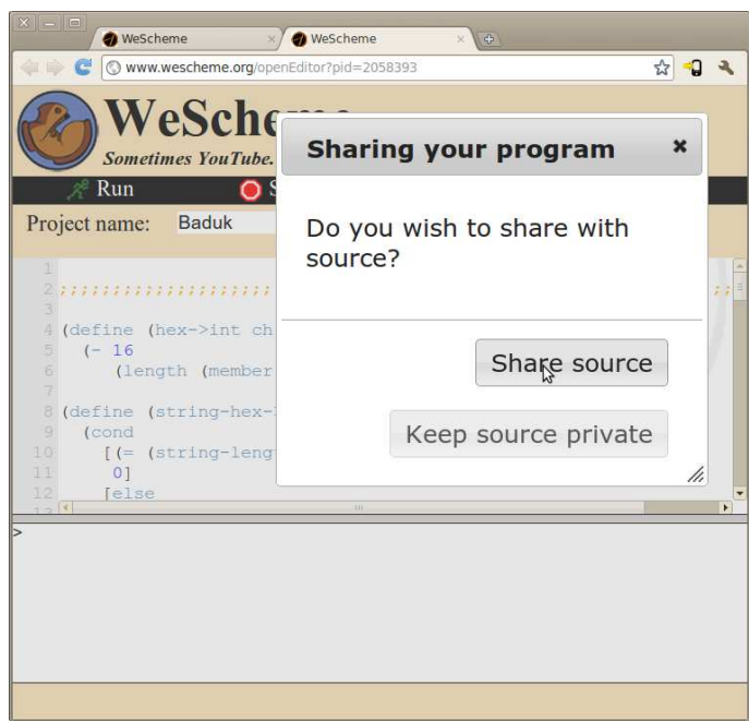
Figure 6: Sharing Dialog