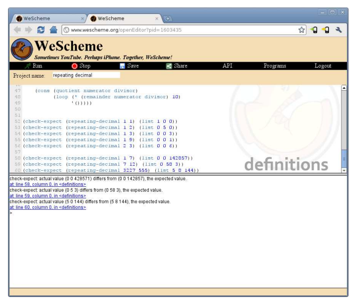
Figure 1: WeScheme

substitution, as taught in schools. The kinds of values in WeScheme are much more compelling than those presented in a standard math textbook: rather than just numbers, they can be strings and booleans, but also images, sounds, and graphical animations. This combination of a simple computational model (functions and substitution) over rich values (strings, images, etc.) proves to be sufficient for writing quite sophisticated programs, including interactive games. A full discussion of the details of this curriculum is given in our textbooks [1] [3].