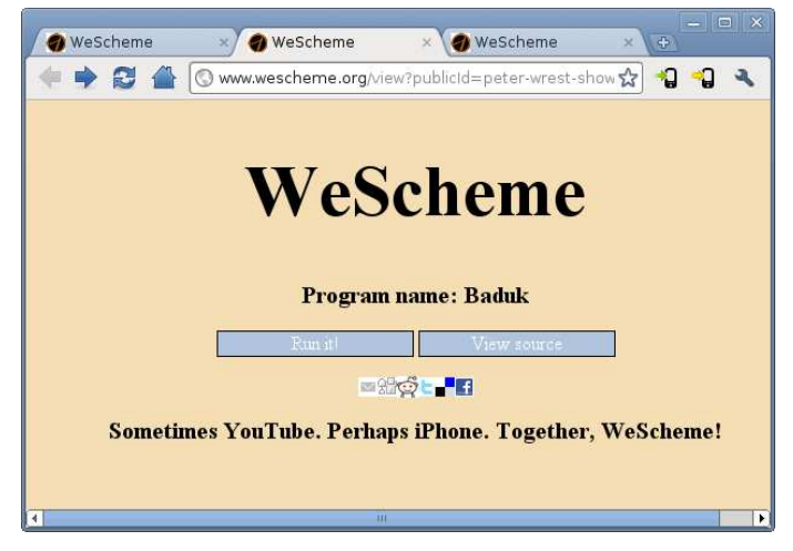
Figure 5: Visiting a Shared Program URL