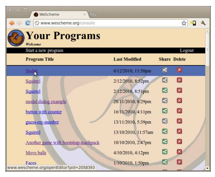
Figure 3: Program List